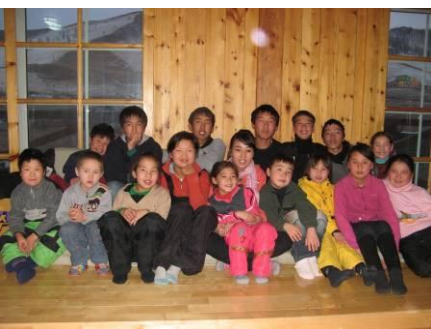
<< during a trip

On behalf of Asian Foundation I would like to thank you very much for your prayers and support during 2008 and I wish you a merry Christmas and a Happy New Year!