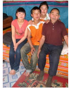
granddad and grandchildren

On our third haschaa we also have two gers. In one of the gers a granddad has lived with his three grandchildren for several years. The two girls are good students. The boy is deaf and attends a special school for the deaf.