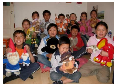
all the kids received a cuddly toy from a Dutchman >>